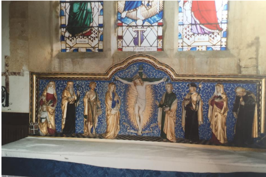
Reredos at Shipton Sollars