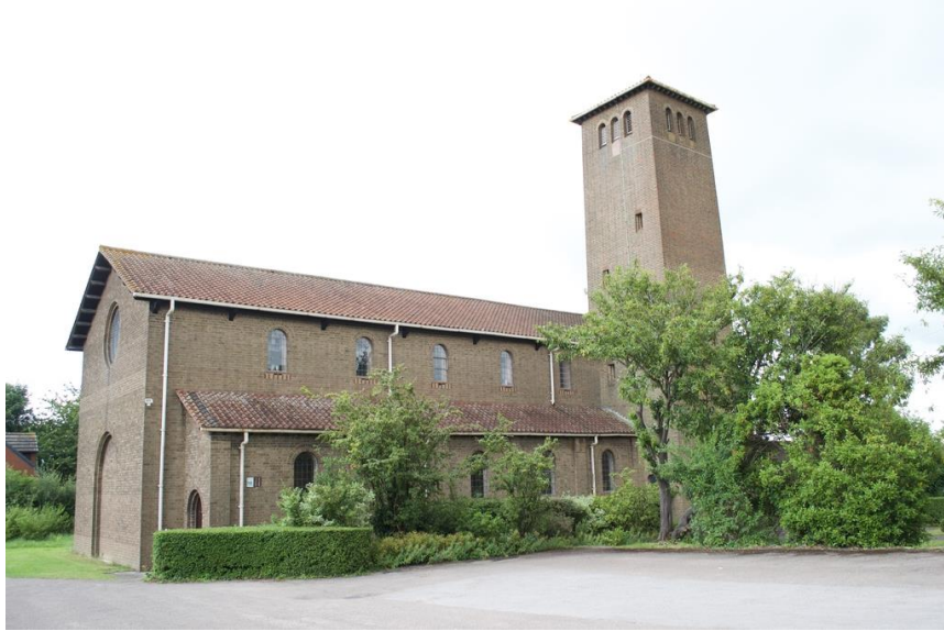
St Oswald's Church, Coney Hill