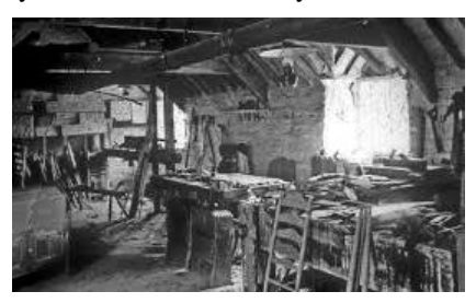
Daneway workshop, showing one of the distinctive ladderback chairs

Sapperton, which they leased from Lord Bathurst for £75 a year. There they made solid handcrafted furniture for sale and for their own use out of local woods, using no mechanical tools except a circular saw. Among their most popular designs were ladderback chairs. Gimson's main talent was as a designer, but the other two were expert craftsmen. In 1900 with Lord Bathurst's agreement they all moved to Daneway House, where they restored the