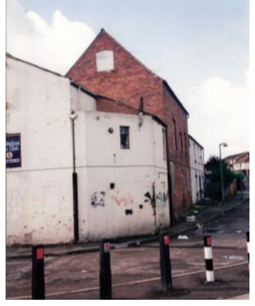
Lower Alstone Mill until recently

What remained of the unlisted brick-built former corn mill by the reduced flow of the Chelt at the end of Arle Avenue, a victim of twenty-first century vandalism and fire-setting, had had nothing to do with milling since the first world war. If its machinery had not been removed during the second, it would have gone when the building was converted into a social club for the neighbouring gas works around 1950. After the planning application had been approved by Cheltenham Borough