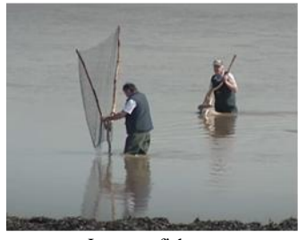
Lave net fishermen

Records of fishing on the Severn go back to the middle ages. Rose showed a 13th century grant for 'putchers' (wicker fish traps for salmon) at Frampton. A boat with a very shallow draught was used, and ranks of putchers on a fixed frame were built across the river - very effective, but an obstacle to shipping. A Fisheries Act of 1801 challenged the legality of such 'fixed engines', and many were removed. In the early 20th century salmon packed in ice were sent up to London,