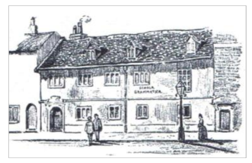
The old Grammar School in the High Street