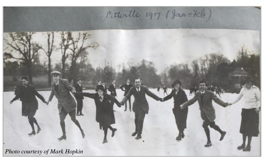
As another mild damp winter draws to a close, here is a memento of winter in days gone by. Will scenes like this one from a 100-year-old album ever be repeated, at least in our lifetime?