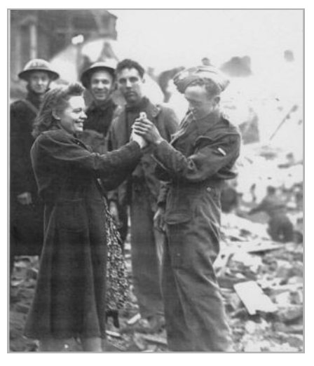
A duckling was found alive in Brunswick Street after an air raid in 1942.

own refuge room at home, 'otherwise they may come into contact with the gas, or get splashed by it, and contaminate vou,' with the reminder that 'animals will help to use up the air supply in the room. To be on the safe side, count two dogs or cats as one person in choosing the size of your refuge room.' Owners could not be given a baby gas mask for their pets, although there were some designs to be had privately. (There is a cat's gas mask in Bristol City Museum & Art Gallery collections.) It was difficult to feed pets, as there were no special rations of pet food. Although domestic animals were not regarded as a war priority the Government set up a National Air Raid Precautions Animal Committee, which included the