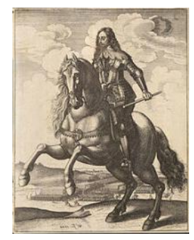
Charles I commanding his troops

ment produced a Protestation of allegiance to Charles I and the Church of England which all adults over 18 were required to sign. It found support in some places (Cirencester was in favour) and resistance elsewhere (Tewkesbury opposed it). Factional fighting had already broken out by the time the King raised his standard in August 1642. He was at a disadvantage: his armoury was mostly in London and Parliament seized it, the Navy declared for Parliament and he had few trained troops, his army consisting mostly of farm workers recruited from country estates. At the battle of Powick Bridge on 23rd September the King's nephew Rupert of the Rhine and his cavalry were victorious, but the battle of Edgehill