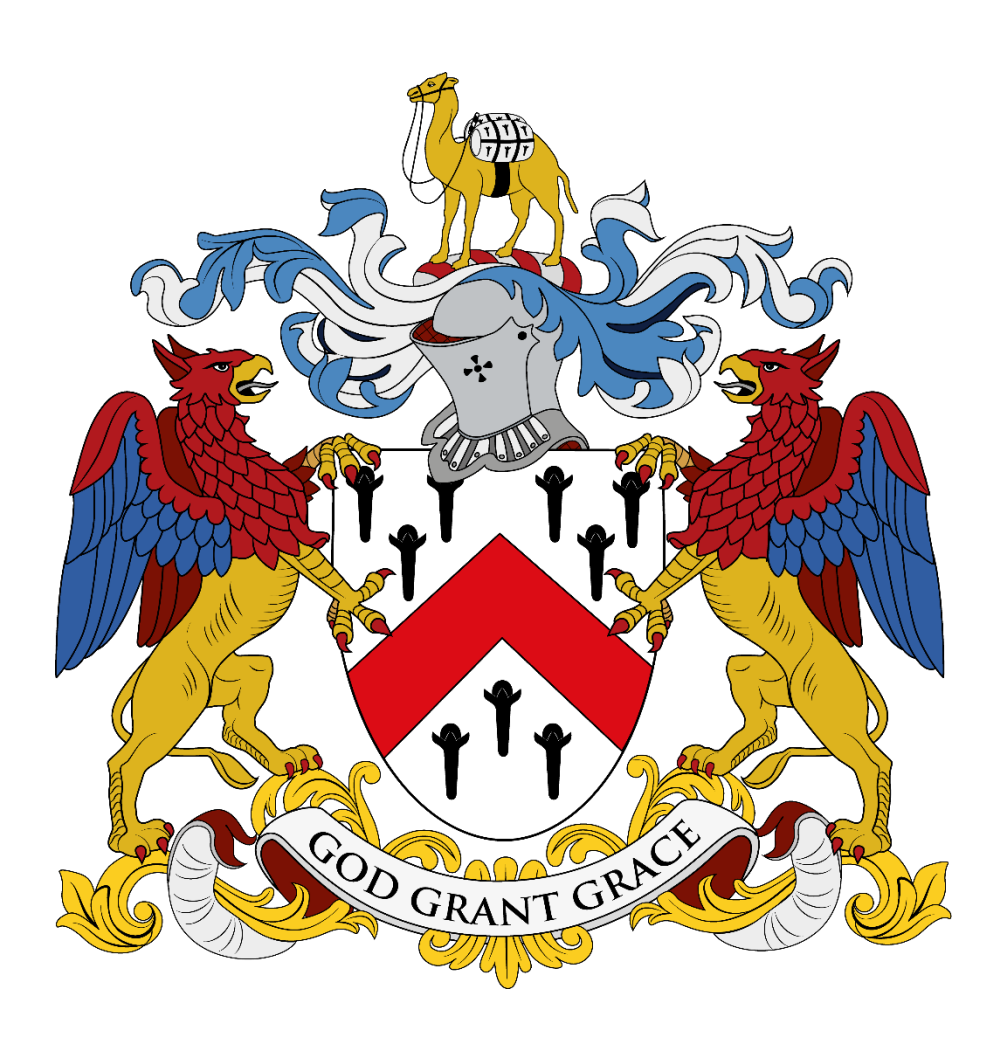
Fig 4 The arms of the Worshipful Company of Grocers